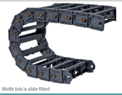
DC 8 (200x40)