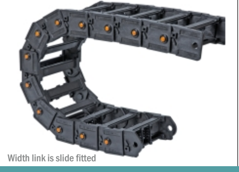
DC 7A (175x40)